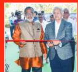
Maharashtra's Industries Minister inaugurating