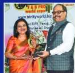
President of Goa Chamber of Commerce welcomed