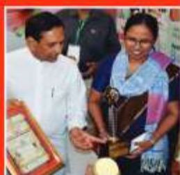
Sri Lankan Minister & Kerala Health Minister