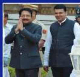
H. E. Governor Rao & CM Fadnavis of Maharashtra