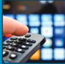
TV & Cable Channels