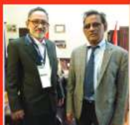
President of Mauritius & CMD of Impex Chamber