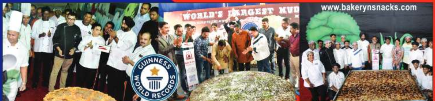
Trinity are holders of the Guinness for the World's Largest Fish Patty (cutlet), Choco Mud Pie (cake) & Bread Pudding (custard) attempt