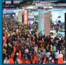
In Venue Displays