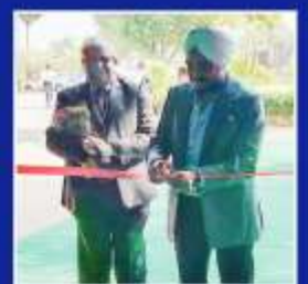
Hotels & Restaurants Association President