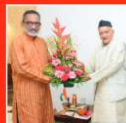
Governor of Maharashtra & Impex Chamber Mg. Dir.