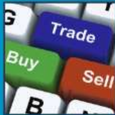
Associations & Chambers