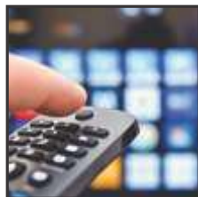
TV & Cable Channels