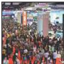
In Venue Displays