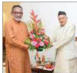
Governor of Maharashtra & Impex Chamber Mg. Dir.