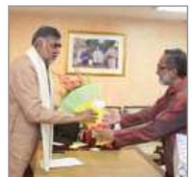
India's Tourism Minister Prahlad Singh Patel