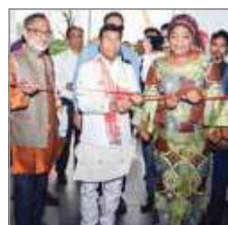
India's Minister R Teli & Congo Ambassador