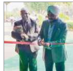
Hotels & Restaurants Association President