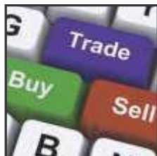
Associations & Chambers