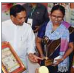
Sri Lankan Minister & Kerala Health Minister