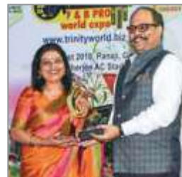
President of Chamber of Commerce welcomed