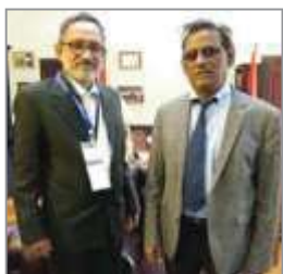
President of Mauritius & CMD of Impex Chamber