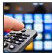
TV & Cable