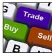
Assns & Chambers